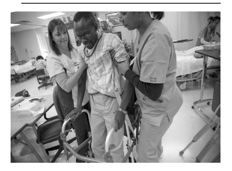
Sources: U.S. Department of Labor Statistics and the Texas Workforce Commission.