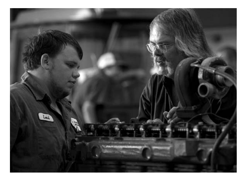
(Note: Individual earnings may vary based upon the job setting and position. These are ranges not guarantees of earnings.)